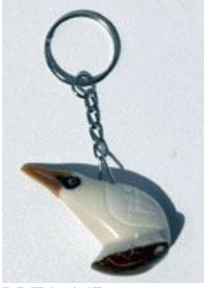
LLTA-157 tropical bird